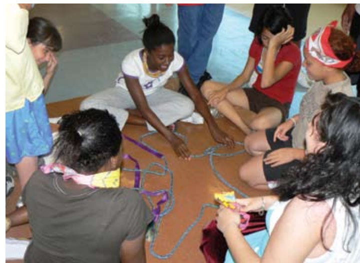
Pre-teens and teens practice skills in a group setting.