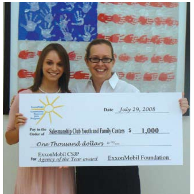
Salesmanship Club Youth and Family Centers received the Agency of the Year award from ExxonMobil Foundation, an award granted to only one of the 75 participating Community Summer Jobs Program agencies. In addition to the award, SCYFC received a check for $1,000 to support our work with children and families.