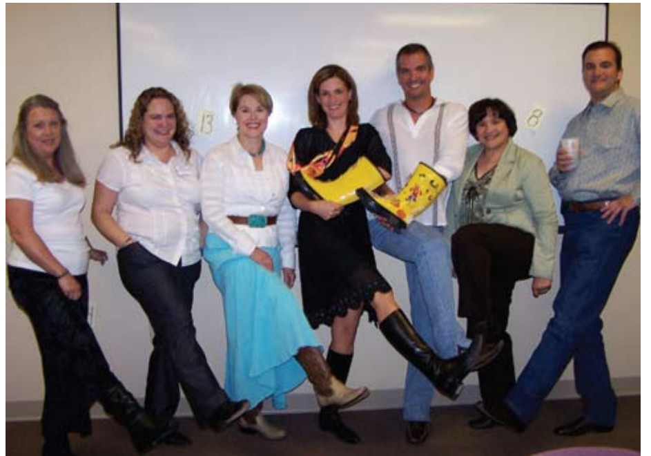
Employees participated in a "kick it up a notch: wear your best boots to work" contest in celebration of the campaign.

SCYFC has long been a partner agency of United Way of Metropolitan Dallas.