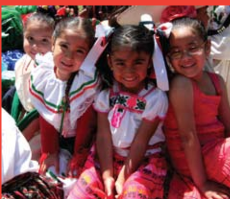
Jonsson students donned their best Cinco de Mayo apparel in the 2008 parade and cultural celebration where the school's student and parent-created floats won first prize for float decorations.

The main attractions at the annual event on Jefferson Boulevard include a parade, live music and a street fair. The event, presented by the Oak Cliff Coalition for the Arts, will begin at 10 a.m. Saturday, May 2, beginning at 200 East Jefferson at Cumberland and ending at the Ice House Cultural Center.