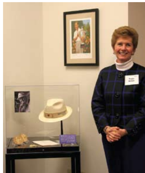
Nelson lent his name to the Byron Nelson Golf Classic in 1968, and his namesake has continued to benefit the children we serve ever since.